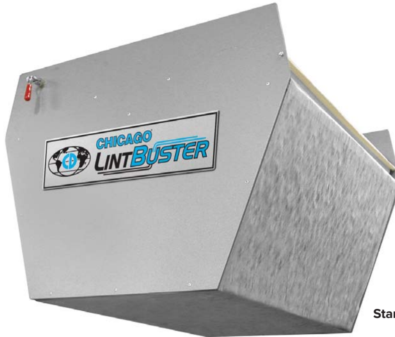
Standard Full Size